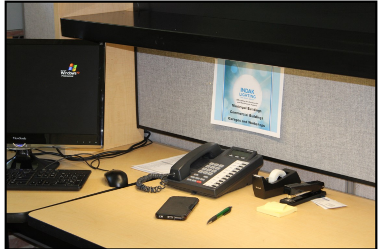
Under cabinets, in work stations or lighting alcoves are ideal applications for the Indak Under Cabinet Task Light.